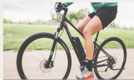
Electric Bicycle Model Ordinance

The WMPO re released a Request For Proposals (RFP) for a bike share program. Bike share is a service in which bicycles are made available for public use on a short term basis. Bike share can reduce vehicle miles traveled, increase mobility options for locals and tourists, and reduce traffic congestion. Currently, the City of Wilmington is the only WMPO member jurisdiction to pursue a bike share program.