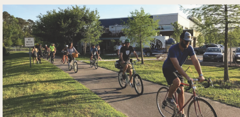
Cape Fear Change in Motion 2020

In September, 2020 the Go Coast Committee approved the first draft of the short-range TDM plan "Cape Fear Change in Motion 2020". Go Coast held a public comment period from December 3, 2020 to January 3, 2021. The public comment period was promoted on the Go Coast and WMPO social media pages, advertised in the Star News, and shared through email to 13,000 local residents. The Star News also wrote a story on the short-range TDM plan and its public comment period. Go Coast held a virtual open house on December 16th from 6 to 7 pm to give residents the opportunity to ask questions and provide feedback in-person. In total, Go Coast received nearly 50 comments. Go Coast staff will review the comments and make recommended changes to the plan before the February Go Coast meeting.