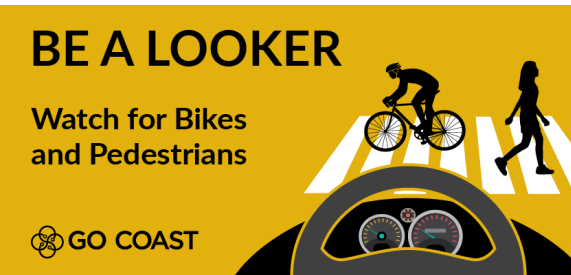
Examples of billboard content run during the Cape Fear Memorial Bridge lane closures.