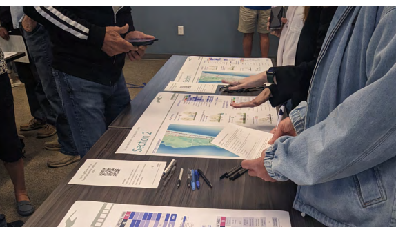
Public meeting at Kure Beach Town Hall on March 20, 2024 for the Island Greenway Feasibility Study, for which the WMPO is on the steering committee.

Go Coast staff attended the Safe Mobility Conference in Chapel Hill, NC during March 2024. The conference was organized by AAA Foundation for Traffic Safety and UNC Highway Safety Research Center. Topics of interest included the safe systems approach, safe access to transit by bicyclists and pedestrians, and community and stakeholder engagement around safe transportation planning.