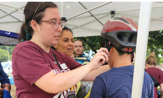
Go Coast staff fits a child's helmet at an outreach event in summer 2023.

The WMPO applied for 100 children's bicycle helmets to be distributed to children from low-income families through NCDOT's Bicycle Helmet Initiative. The application was submitted February 9, 2024, and if awarded, helmets are anticipated to be delivered in late April.