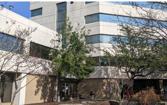
The meeting was held at 305 Chestnut St, 4th floor, in downtown Wilmington.